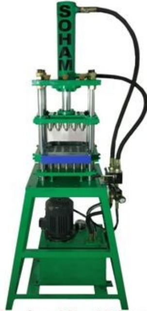
Sambrani Cup Making Machine 20 Cavity